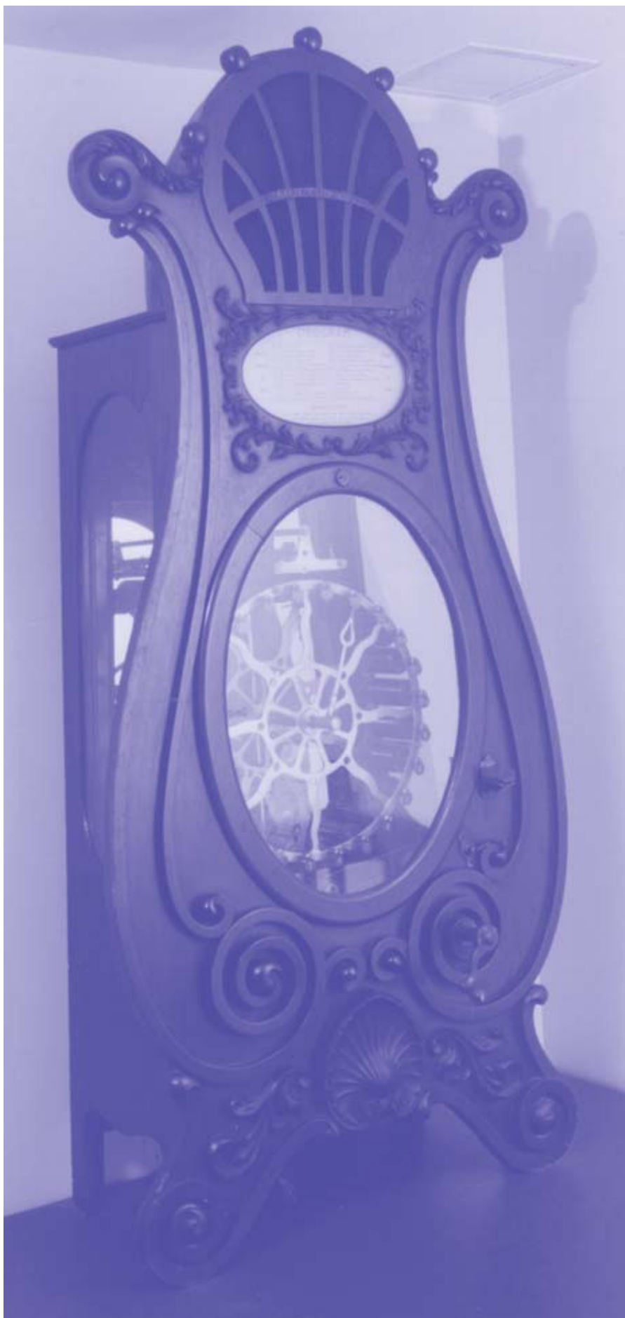
Multiphone, c. 1906 Collections of the New Jersey Historical Society, Newark